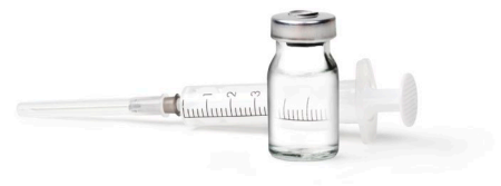
A syringe with a needle and a vial