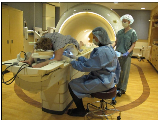
Figure 1: The radiologist prepares for the biopsy.